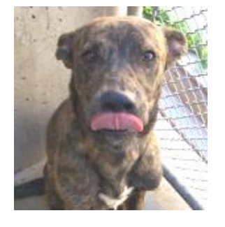
Whiskers flared forward