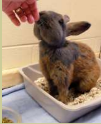
Small Mammal comforting