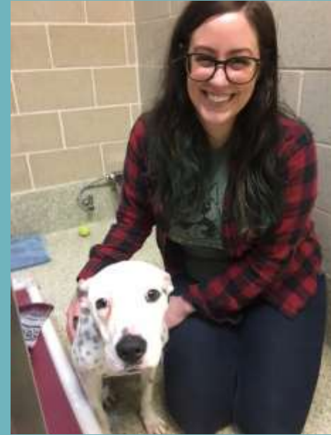
SAM ADOPTIONS/FOH SUPERVISOR