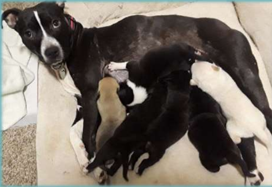
Dixie and her SEVEN puppies currently in foster

Foster volunteers logged over 46,000 hours in 2019