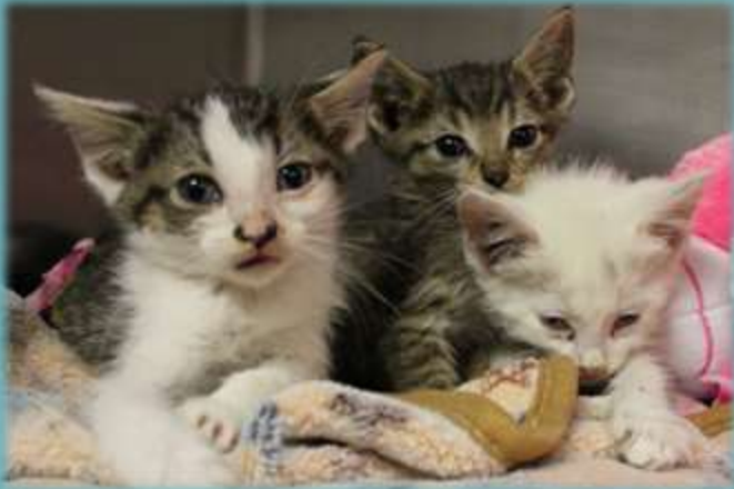
Kittens – fostered and Adopted!

So many puppies and kittens! A snapshot of foster numbers on October 1 st 2019 showed 264 kittens and 10 dogs in foster.