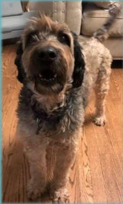
Satie – Adopted!