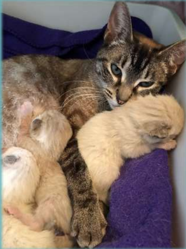
Nursing Mama and Kittens - Adopted!