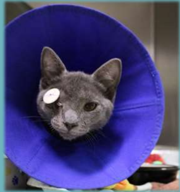
Mad Eye Moody, aka Ragetti – Adopted!