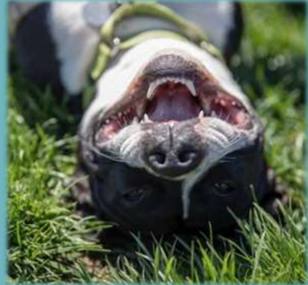
Sabina – still in Foster and available for adoption!