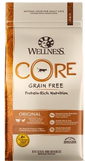
Wellness CORE Cat

They require a diet that is high in protein and low in fiber. Please read labels on any pet food that you may be choosing to feed your pet ferret and always ask your vet first!