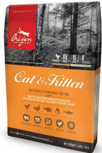
Orijen Cat & Kitten (Chicken, Turkey, etc.) By Champion Petfoods