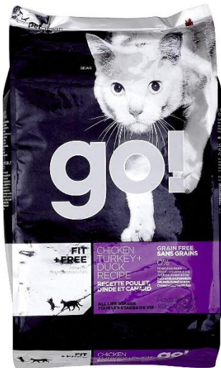
Go! Fit+Free (Chicken, Turkey, etc.) By Petcurean