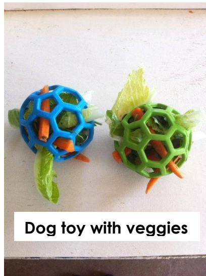
Dog toy with veggies