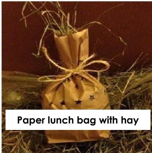
Paper lunch bag with hay

Changing up the enrichment is fun for both the human making it and the guinea pig enjoying it!