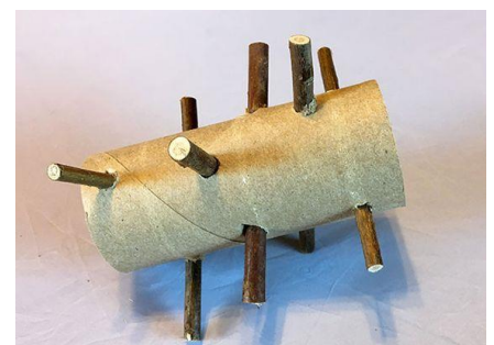
Toilet paper rolls with hay or chew sticks