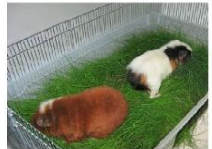
Pet grass/untreated grass