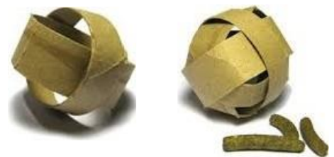
Toilet paper rolls with treats