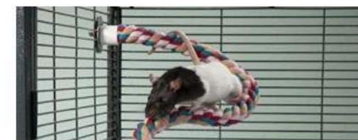
Some bird toys can be used for rats!